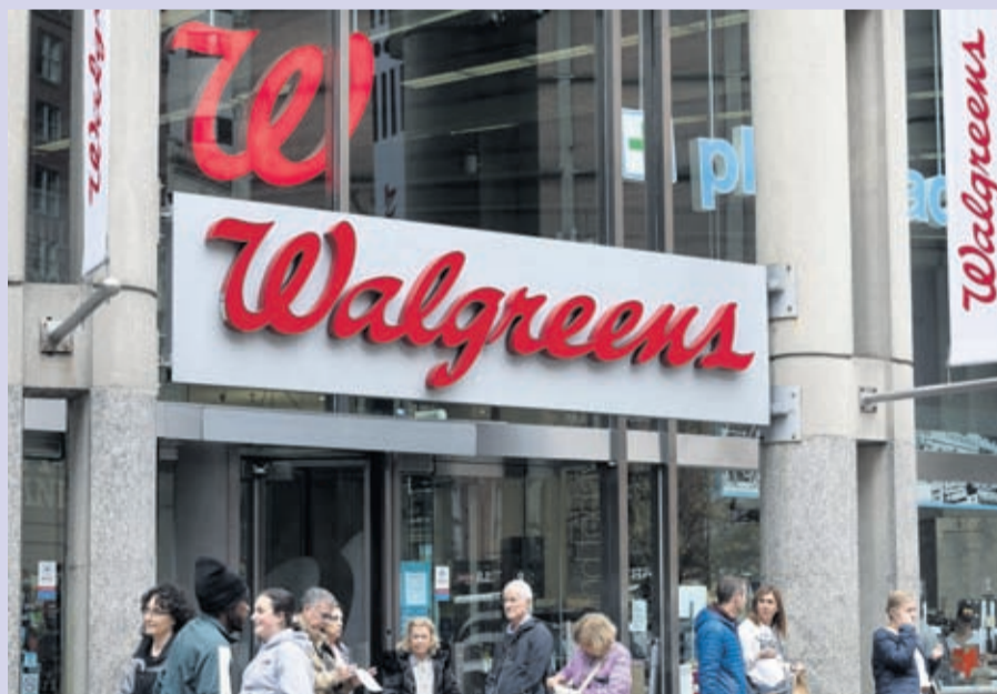
The entrance to a Walgreens is seen on Oct. 14, 2022, in Boston. Walgreens dove deeper into the health care sector on Monday, Nov. 7, when its VillageMD unit announced it would acquire another primary and urgent care provider, Summit Health-CityMD, in a deal worth close to $9 billion.